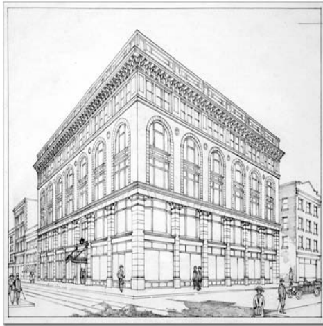
Two-point eye-level perspective

For this assignment, hand-construct a perspective view of your precedent building. Before you begin, first decide on what type of perspective view you want to construct: Either a one-point section perspective or a two-point exterior perspective with the building oriented at no less than 30 degrees from the picture plane. Make the perspective view communicate something about your precedent house. Include set-up and construction lines in your finished drawing.